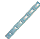
TECHKEWL™ Phase Change Cooling Deluxe Neck Band – Replacement Insert