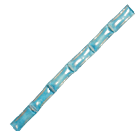
TECHKEWL™ Phase Change Cooling Neck Band – Replacement Insert